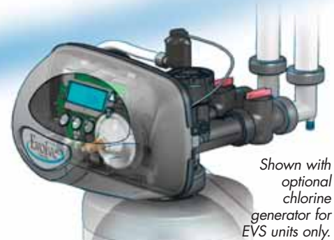
Shown with optional chlorine generator for EVS units only.

With advanced microprocessor-based intelligence, it's like having a water treatment technician right inside the unit.